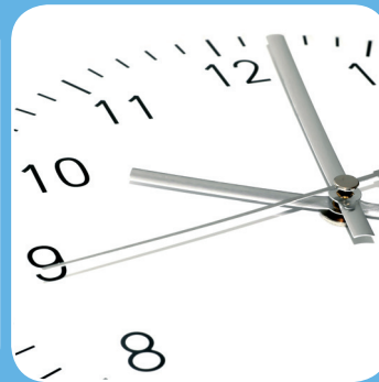
24/7 transaction processing