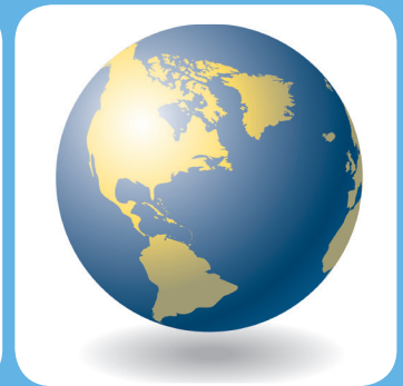
international money transfer

All Postal Vision products are One World Compliant